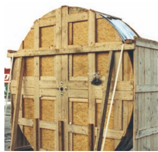
■ Fully harnessed cable carrier system in shipping crate