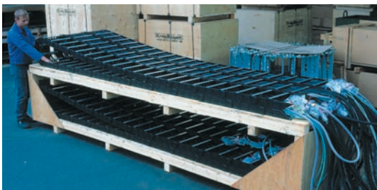
■ Ready-to-connect assembled plastic cable carrier system, packed ready for installation

We develop, design and supply all components required for your individual cable & hose carrier system.