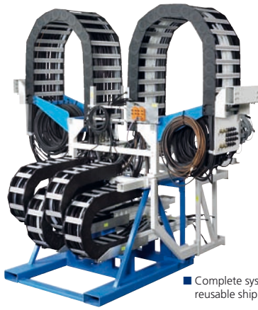
■ Complete system with reusable shipping fixture

Our warehouses offer cables, plug-and-socket connectors as well as many other individual components.