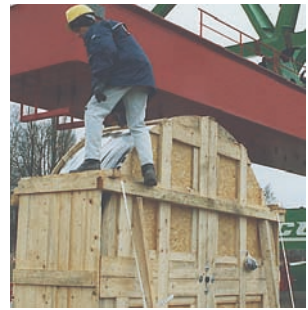
■ Assembly of the fully harnessed cable carrier system