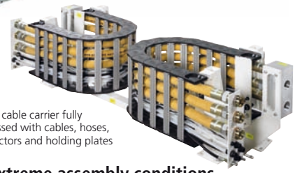
■ Plastic cable carrier fully harnessed with cables, hoses, connectors and holding plates